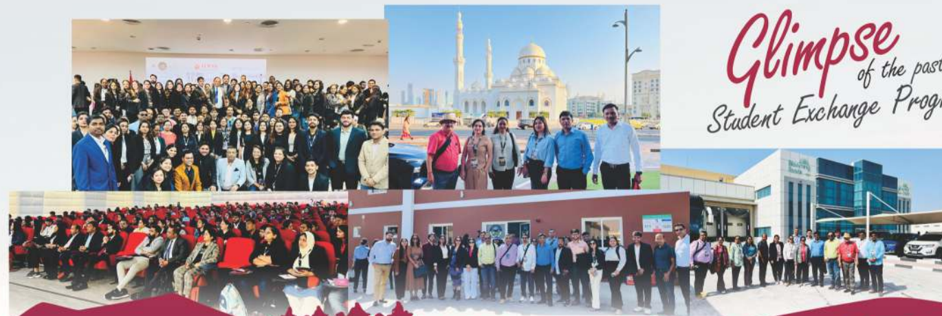
Student Exchange Program in Dubai - October 21 to 25, 2024

Glimpse of the past Student Exchange Program