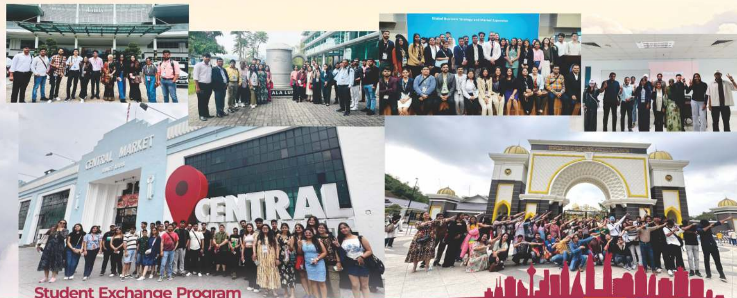
Student Exchange Program in MALAYSIA - February 16 to 22, 2025